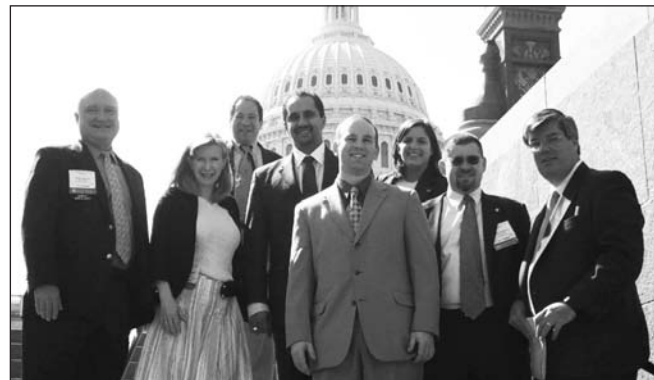
CCEP Members attending L&A Conference in Washington, DC

Connecticut's delegation advocated for our patients by